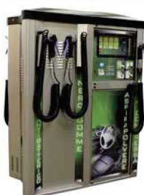
Macchina con opzionale Machine with optional